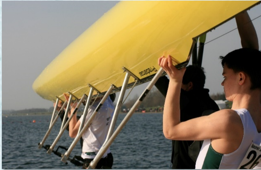
Boys quad about to launch and race