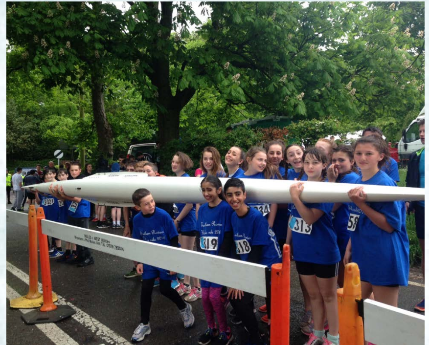
All Juniors running whilst carrying a rowing boat up the hill at 'The Killer Mile' at Mow Cop.

Boats, Blades (oars) and gym equipment including Ergo's (rowing machines) are paid for through additional fundraising events organised by Junior parents and contributions from the club.