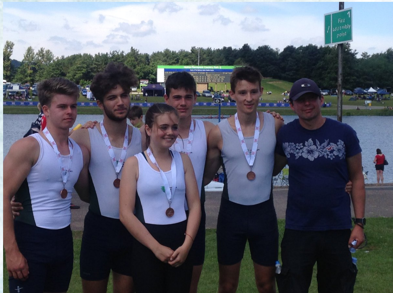
J16's winning Bronze at the British Rowing Championships July 2016

The National Schools Head on the River Thames proved that the club is able to compete at the highest level against the best school clubs in the UK; Trentham Juniors had 3 crews finish in the top 6.