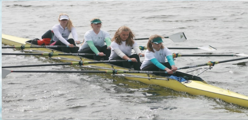
Girls quad training on Trentham Lake

Trentham Boat Club is located within the grounds of the Trentham Estate in Stoke on Trent, Staffordshire.