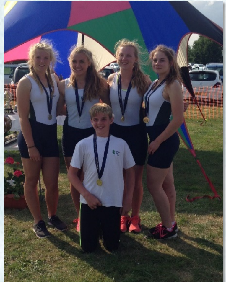
Y11 girls quad celebrating winning gold, coxed by a Y8 boy

Rowing, by its very nature, is a team sport; each child has to work together every time they train or race. The young adults are encouraged to coach the younger ones and share their skills and knowledge and the younger members get to participate as coxes, which gives them the invaluable experience of racing at national level.